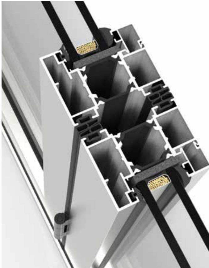
The above section shows the hidden polyamide thermal break within the aluminium profile.

No matter what the weather here in the UK, your HomeView bi folding doors will keep you warm in the winter months and cool in the summer months. Your installer will be able to guide you through glazing available (see page 18) to help you get the most from your doors.