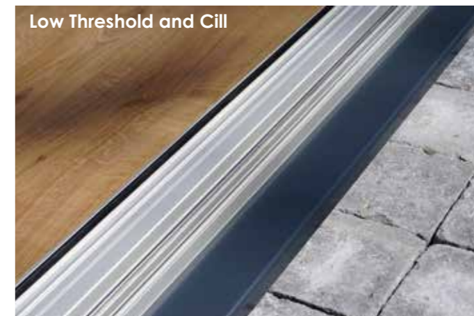
Low threshold and cill with an upstand of 70mm .