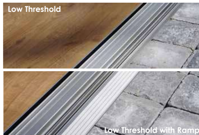
Low threshold with an upstand of 45mm .