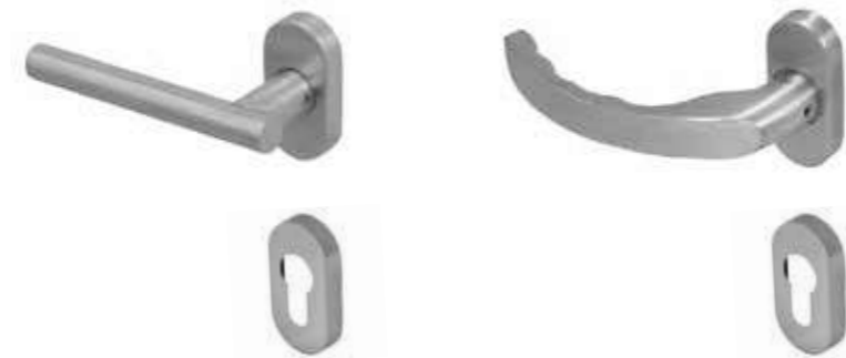
Straight Rose Handle