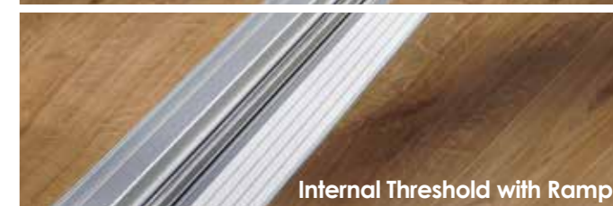
Internal threshold with an upstand of 20mm .