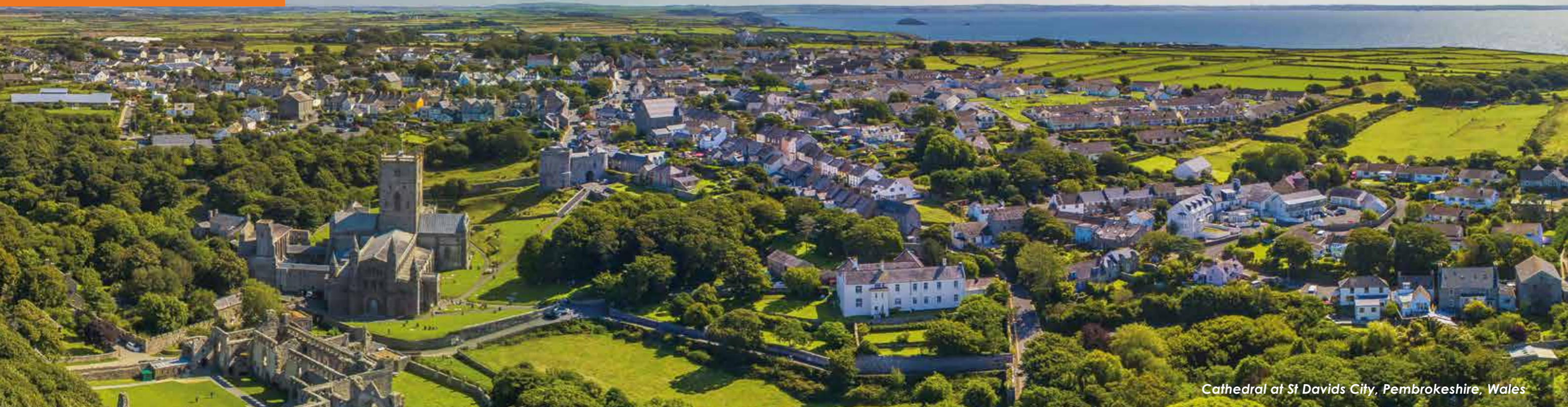
Cathedral at St Davids City, Pembrokeshire, Wales